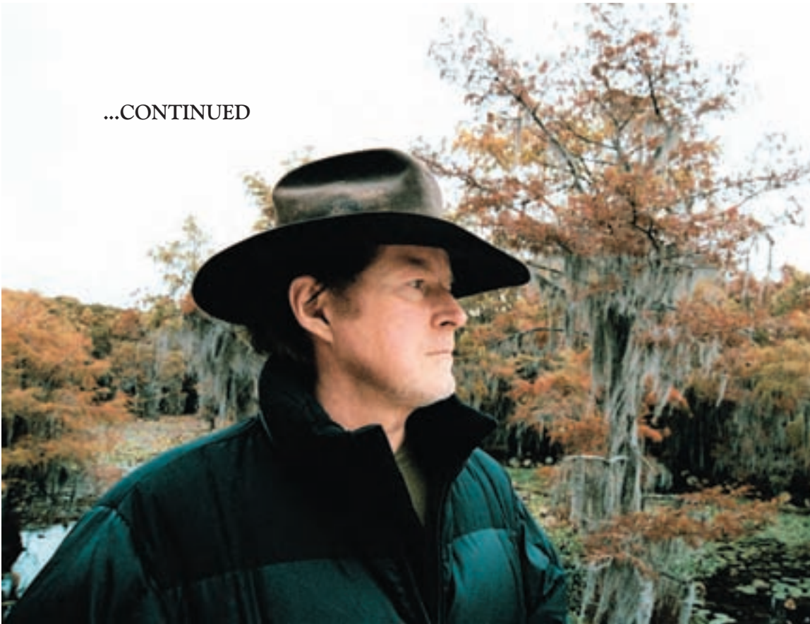
Don Henley grew up in East Texas and spent much of his time outdoors learning to appreciate nature. He has been instrumental in leading efforts to preserve Caddo Lakes (below), a 30,000 acre Bald Cypress Savannah eco-system bordering NE Texas & NW Louisiana.