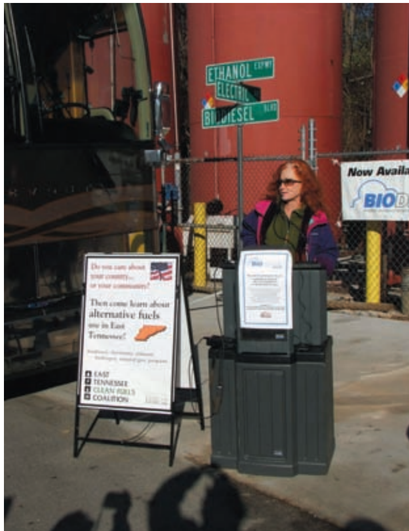
Bonnie Raitt maintains a busy touring schedule that combines her music with her message. Her travelling eco-village provides concert goers with information about products & organizations working in harmony with nature.