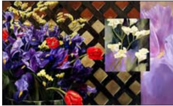
Still life: Tulips and Iris, 36 by 60 inches, oil on canvas.